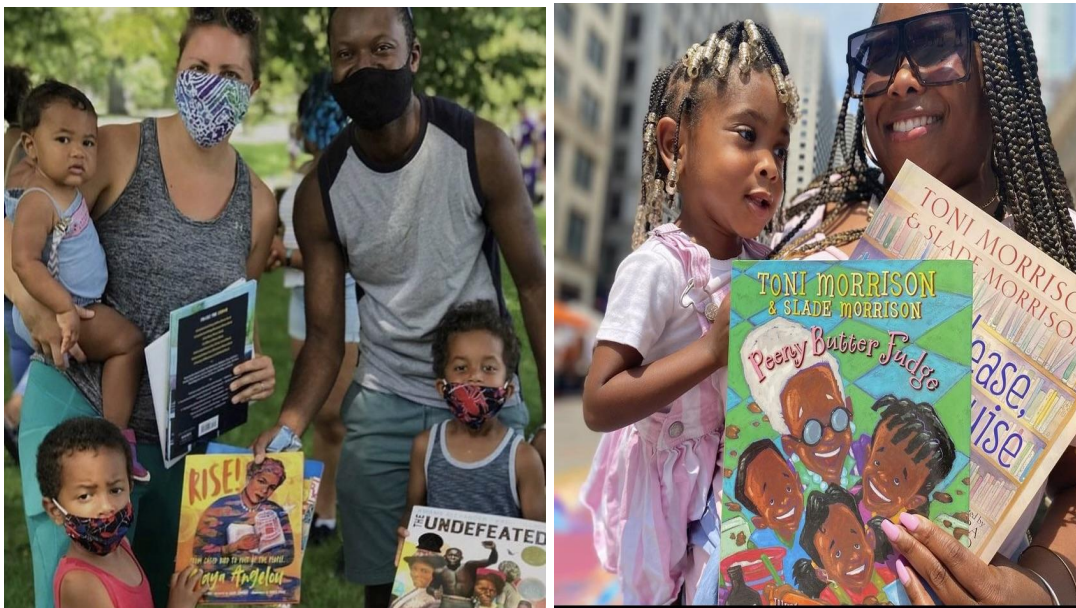
Families at outdoor literacy event receiving high quality books from Brown Books & Paint Brushes