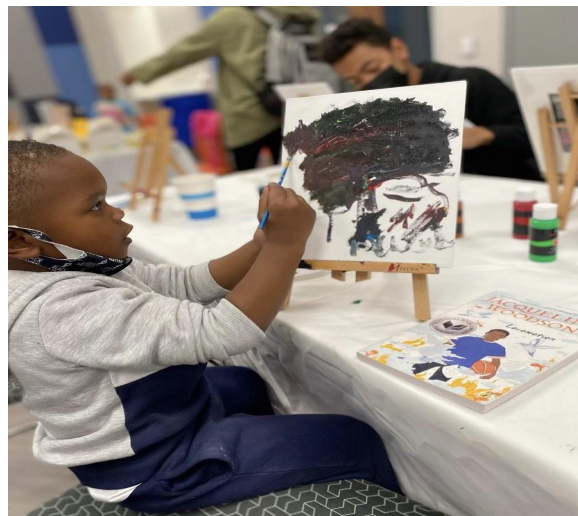
Interactive Children's Painting Station