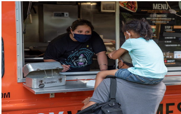
Onsite Food Truck for attendees at 3rd Annual Juneteenth Family Festival (2021) in Morgan Park/Beverly Neighborhood