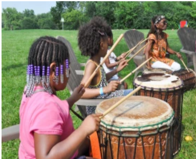
Live African Drumming Circle at Inaugural Juneteenth Family Festival (2019) at Dan Ryan Woods Forest Preserves