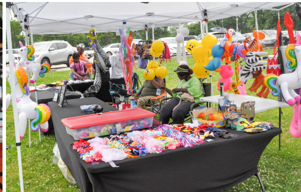
Vendors Area at Inaugural Juneteenth Family Festival (2019) at Dan Ryan Woods Forest Preserves